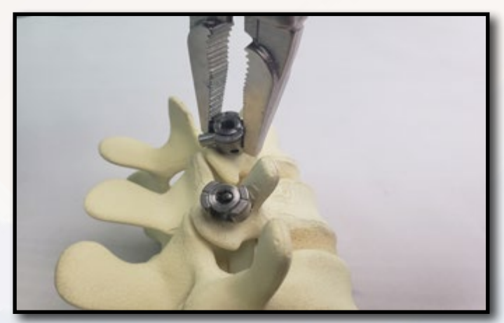
The Vise Grip method, an attempt to emulate what a helicopter socket does easier and more effectively.

Before the advent of the helicopter socket method, if a pedicle screw construct could not be removed due to a locking cap or improper drivers, most cases were closed up. In some cases, surgeons would cut the rod and grab onto the screw with a vise grip to try to rotate it out. It was an inelegant and oftentimes ineffective strategy. Thankfully, with our SHUKLA Copter system, that no longer needs to be the case.