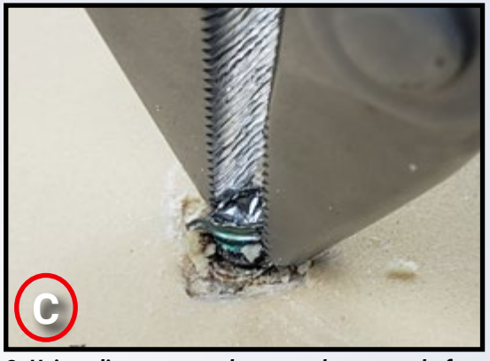
C: Using pliers to try and remove the screw shaft