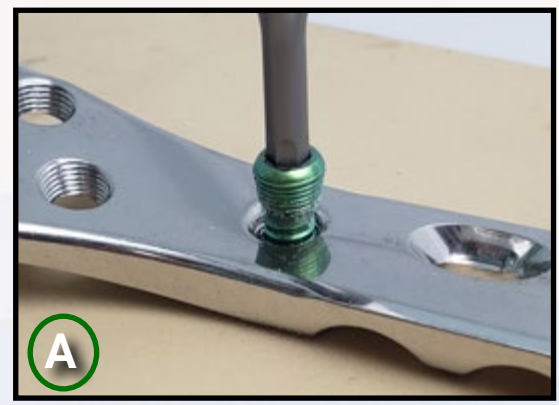
A: The ideal way - using a SHUKLA Maxi Driver

This led to higher O.R. costs, lower success rates, higher surgeon frustration, and lower patient approval. The SHUKLA Maxi removes all of the uncertainty of screw removals and gives a single universal solution.