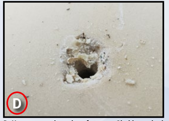
D: Unnecessary bone loss from non Shukla methods