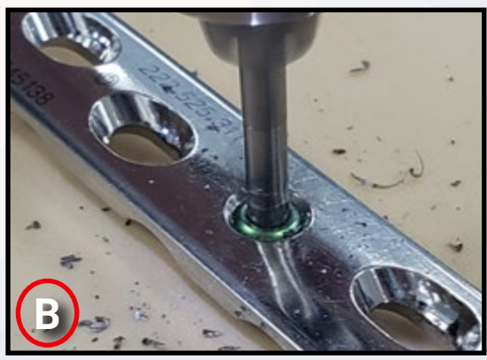
B: Using a drill bit to drill off the screw head